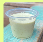
Salsa de Ajo (Garlic)

*All our AREPAS and PATACONES are served with fresh cilantro topping